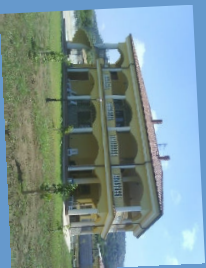
Learn Italian on the countryside at La casa di Calliope!

We can give you individual or small-group lessons of the Italian language, conversation and culture, at your home or hotel or at la casa di Calliope—Bed & Breakfast.